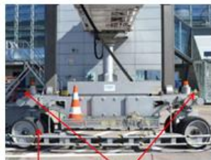
Drive Unit Emergency Stop Buttons