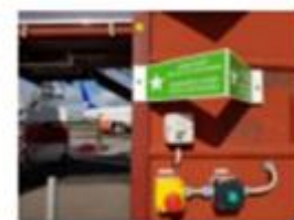
Location at Ramp